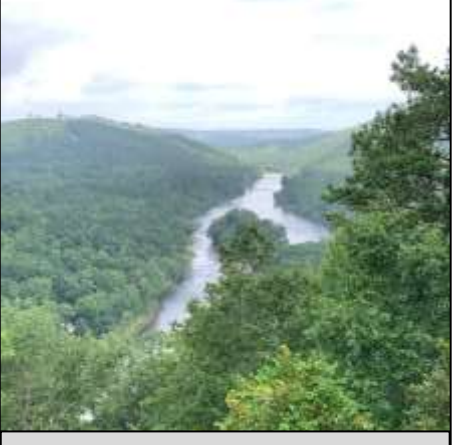
View of the Flint River.