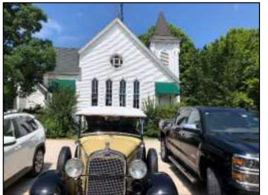
Taste of Lemon